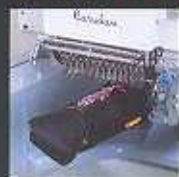
Sleeve Frame (not available on BEDT-ZN-101)