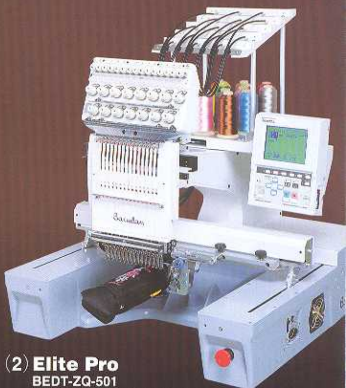
(2) Elite Pro BEDT-ZQ-501 with optional sleeve frame