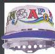
Wide Cap Frames