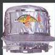
Semi-Wide Cap Frames