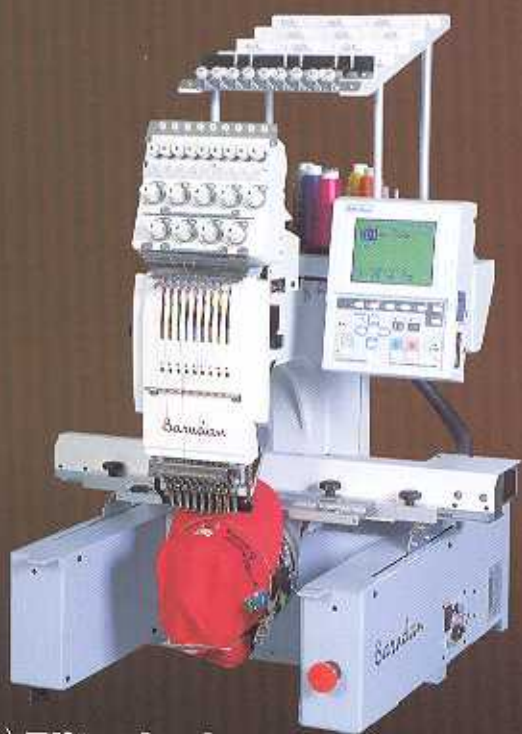
(1) Elite Junior BEDT-ZN-101 with optional cap frame

All models are professionally engineered and very user friendly. You are sure to find one to fit your embroidery business needs.